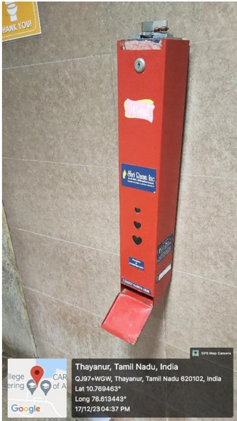
Thayanur, Tamil Nadu, India QJ97+WGW, Thayanur, Tamil Nadu 620102, India Lat 10.769463° Long 78.613443° 17/12/23 04:37 PM