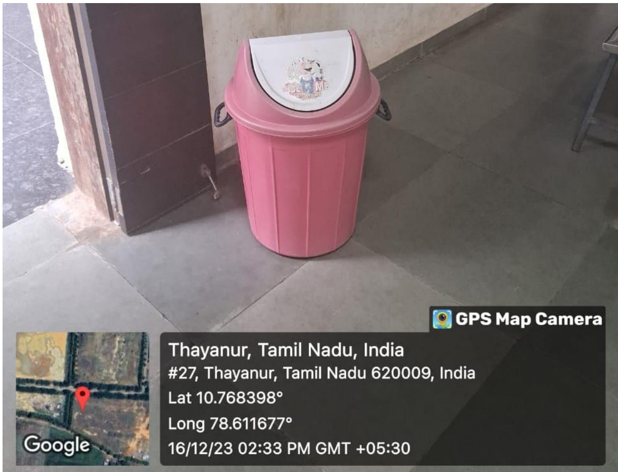
Fig. 7.1.3.1 Dustbins at prominent places in the campus