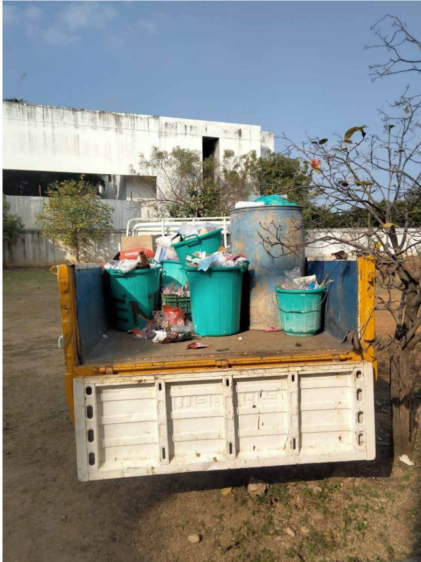
Fig. 7.1.3.7 Waste Segregation for recycling