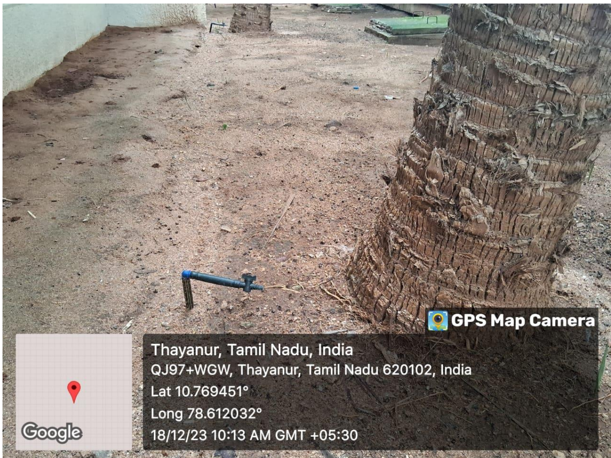
Fig. 7.1.3.3 Sprinklers for water dissipation