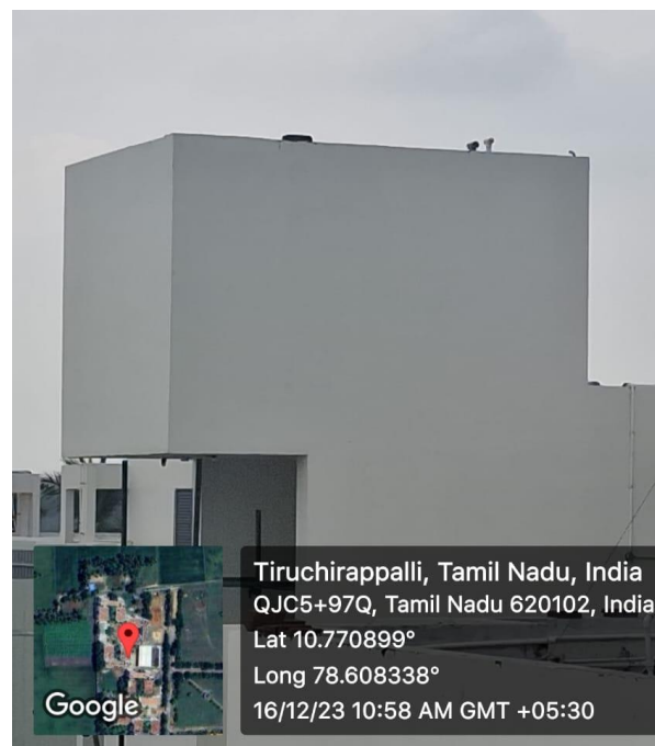
Fig. 7.1.4.4 Water Tanks in college campus