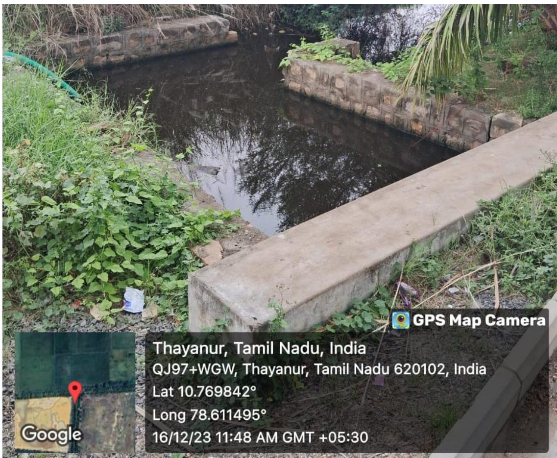
Fig. 7.1.4.7 Canal path in college campus