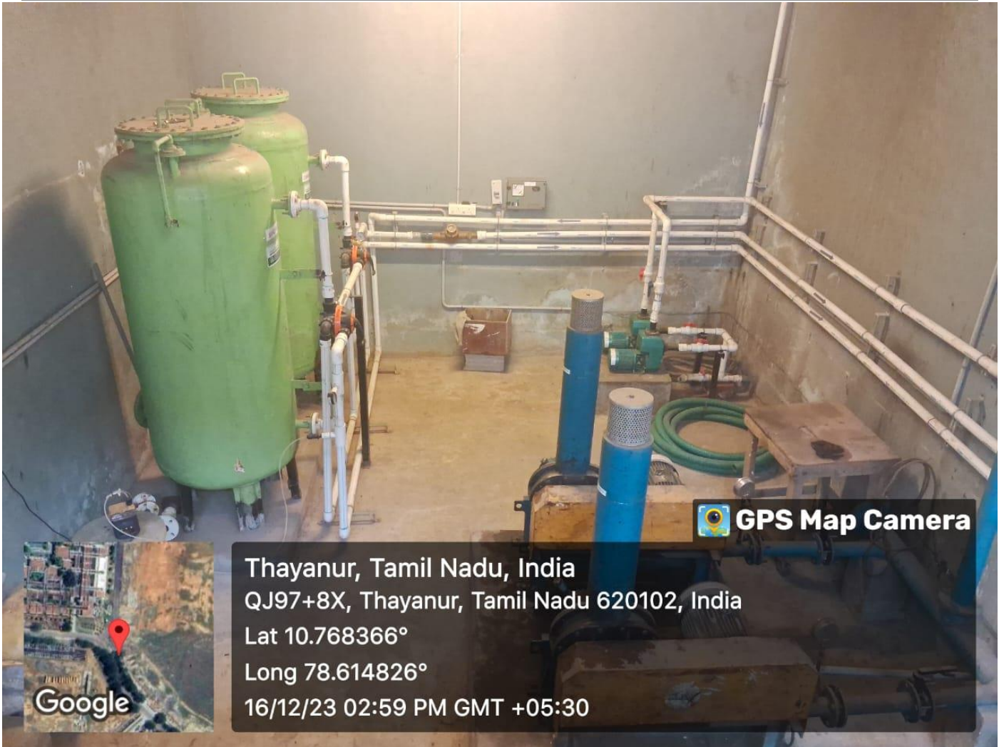
Fig. 7.1.4.5 Wastewater treatment and Recycling