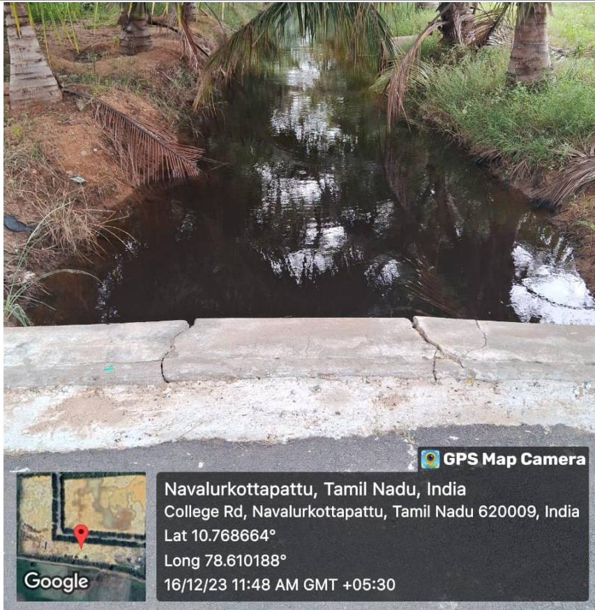
Fig. 7.1.4.6 Canal in college campus