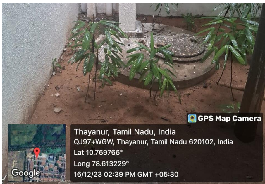
Fig. 7.1.4.2 Rain water collection chambers