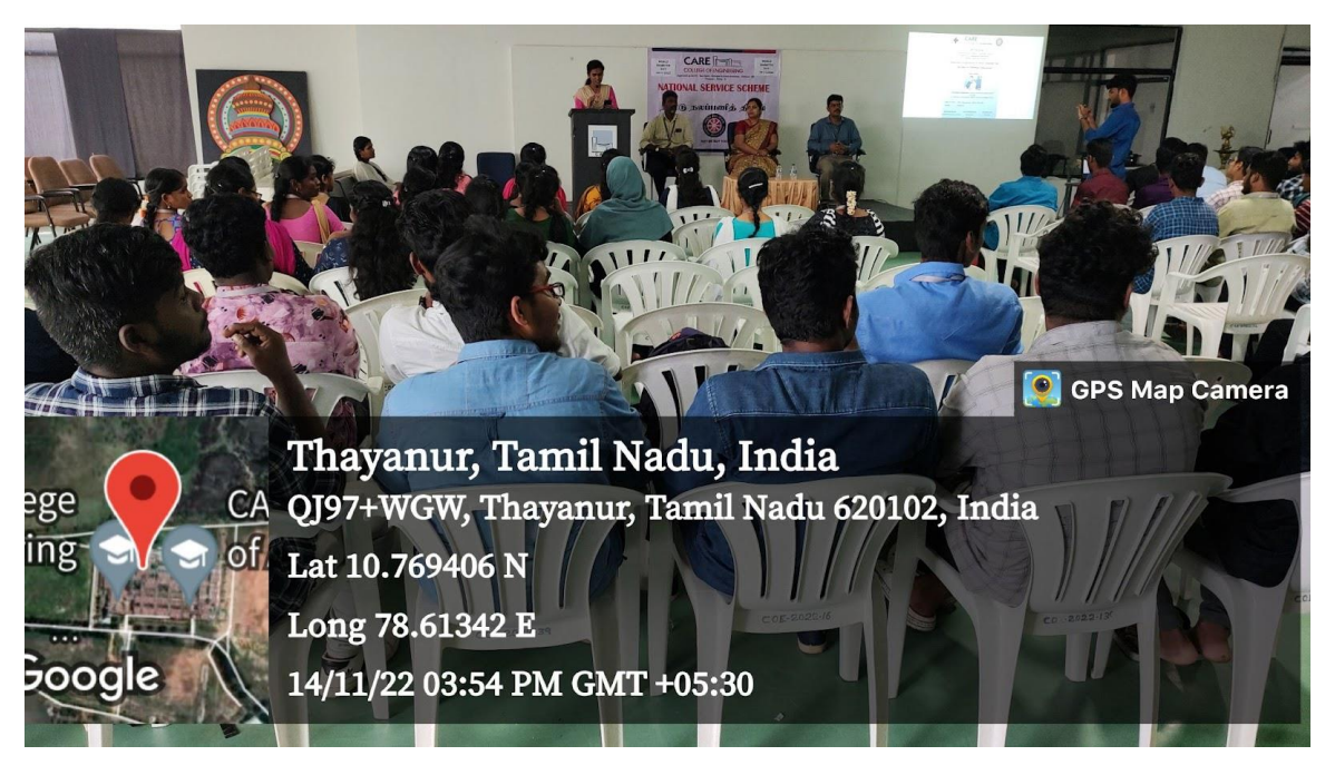
World Diabetes Day – Awareness Program – By NSS