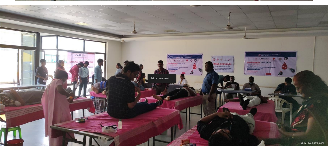
Blood Donation Camp – By NSS