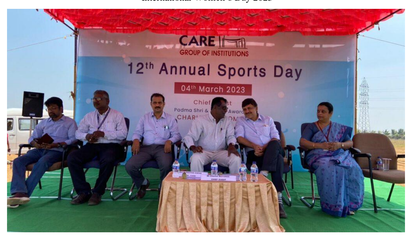
Sports Day - 2023