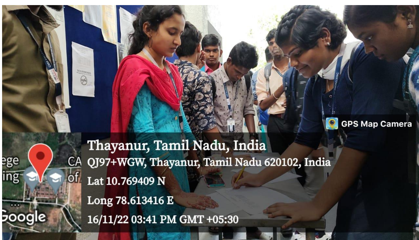
English Club Activities – Life @ Care