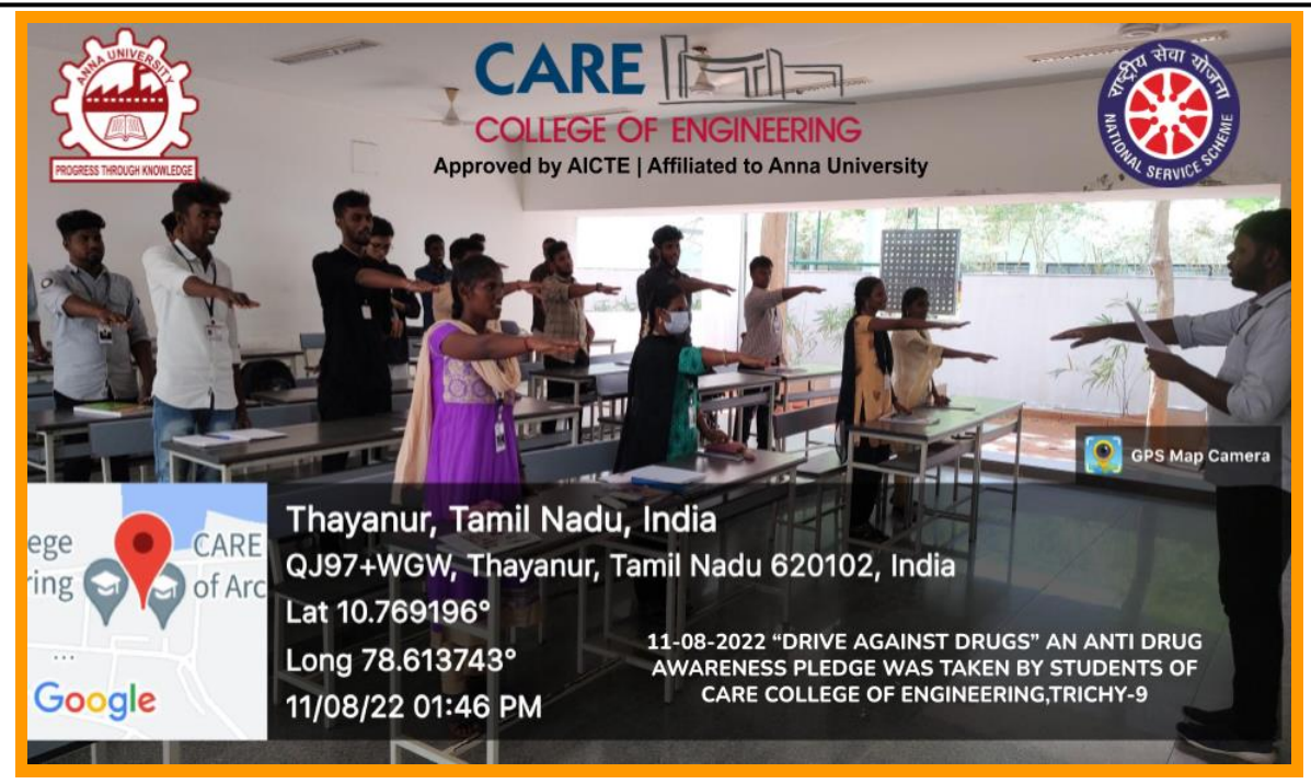
Anti-Drug Awareness Pledge – By NSS