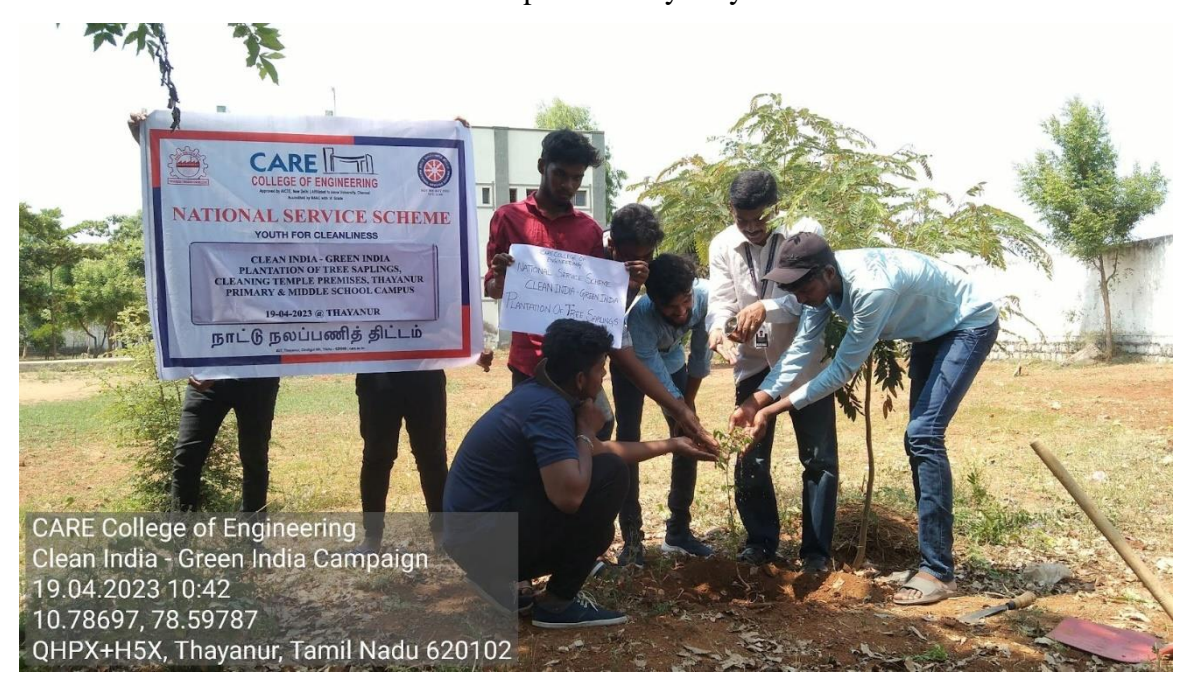
Clean India Green India Campaign- By NSS