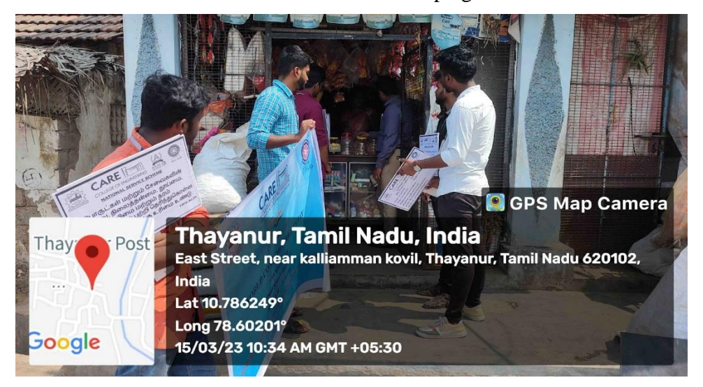
World Consumer Rights Day – Public Campaign – By NSS