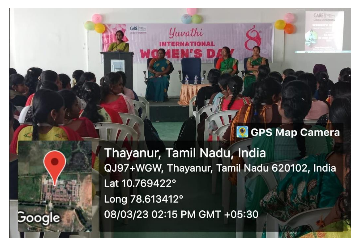
International Women's Day 2023