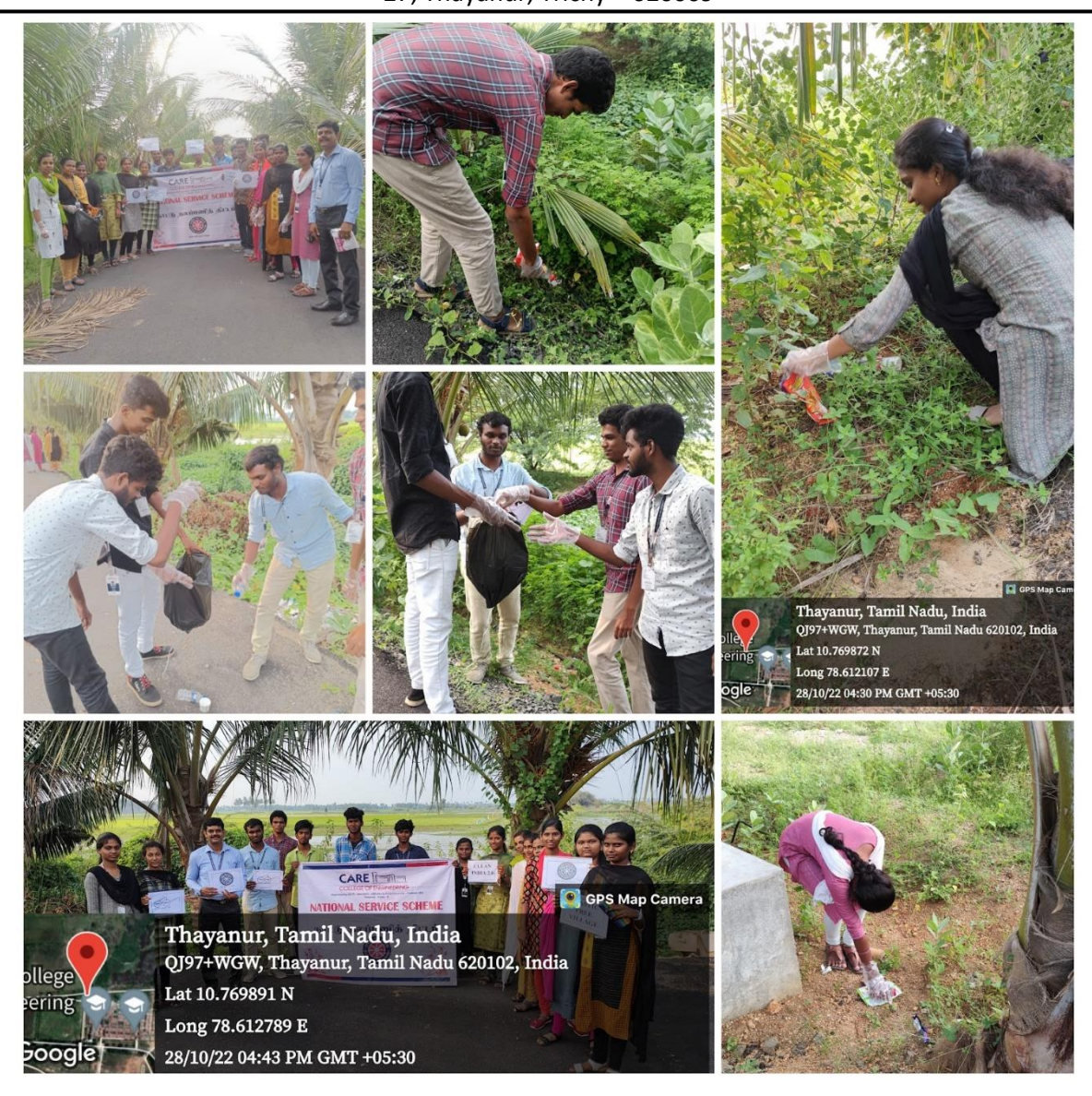
Clean Campus Activity - by NSS