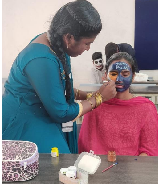
Face Painting Event – Life @ Care