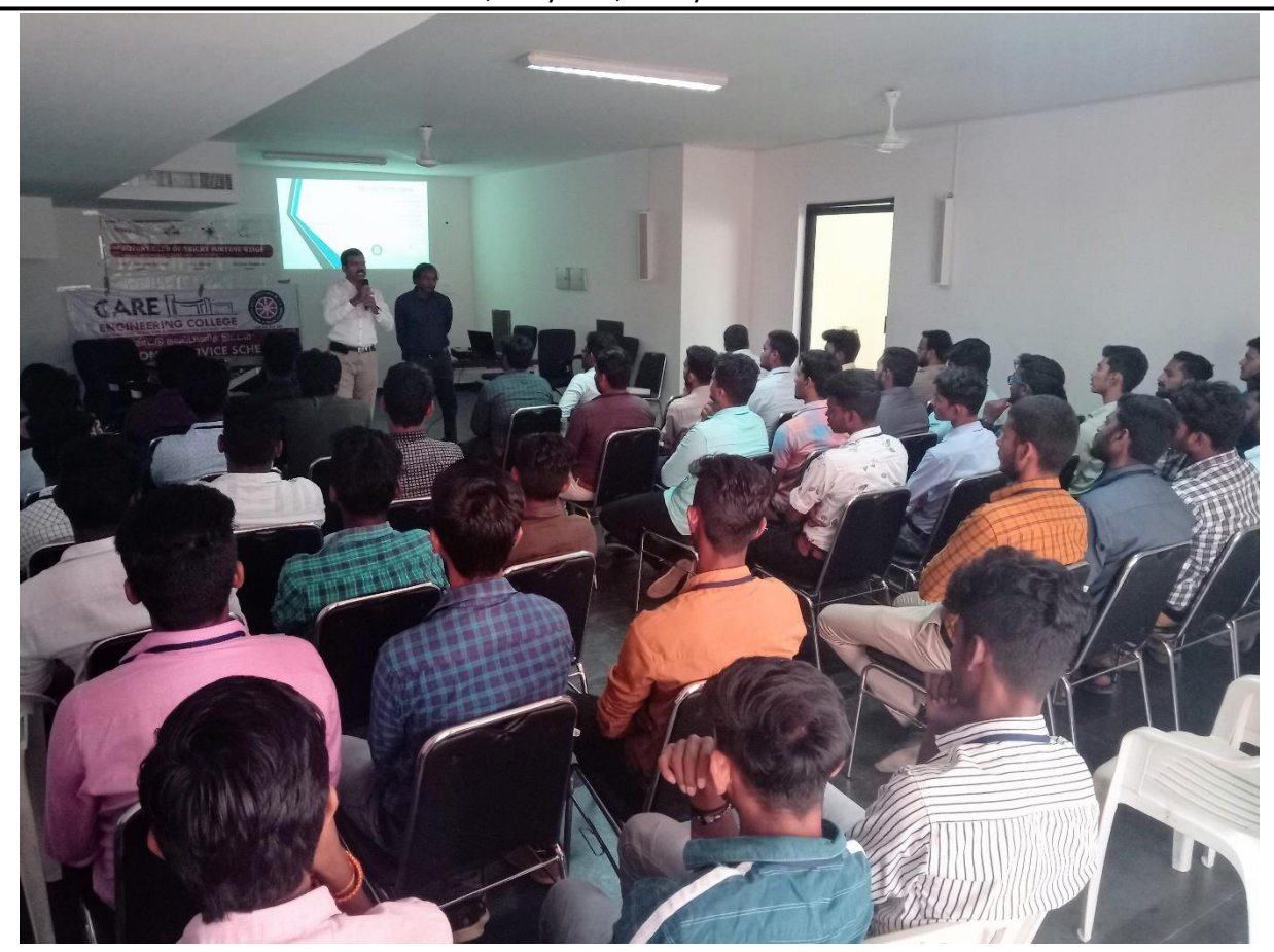
Cancer Awareness Campaign