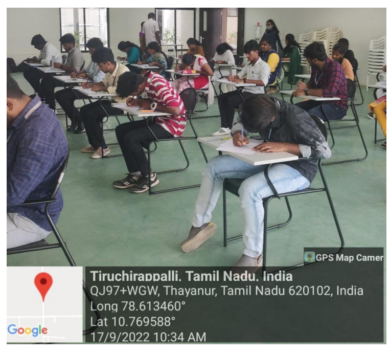
Essay Competition on Sir.C.V.Raman as a Freedom Fighter