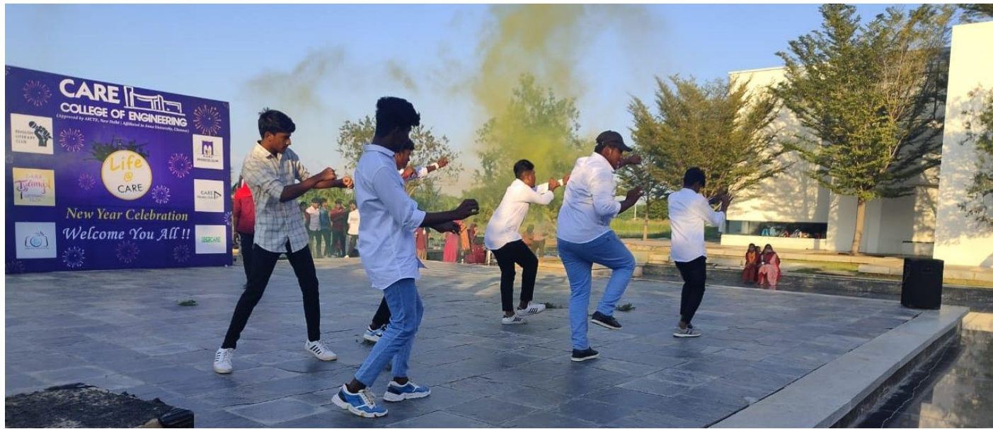
New Year Celebrations – 2023