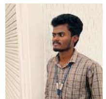
MEGANATH V II YEAR - ECE

Another significant aspect of digital twins is their role in facilitating predictive analytics. By continuously collecting data from connected sensors embedded within physical assets, digital twins provide valuable insights into performance trends and potential issues. This proactive approach allows businesses to anticipate maintenance needs, mitigate risks, and improve overall productivity.